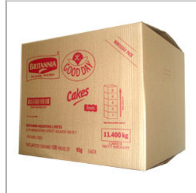
Corrugated Carton Boxes