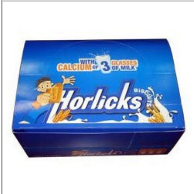
Duplex Board Carton