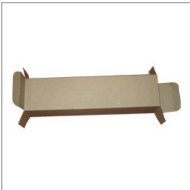
Grey Board Carton