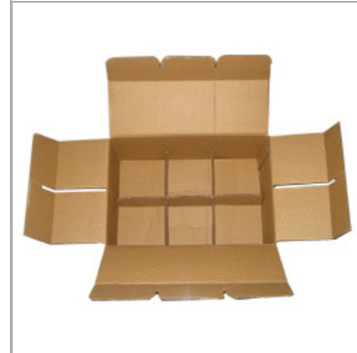
Interlock Pattern Cartons